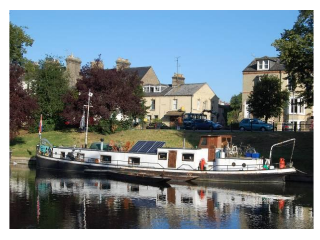
Residential boat on the River Cam