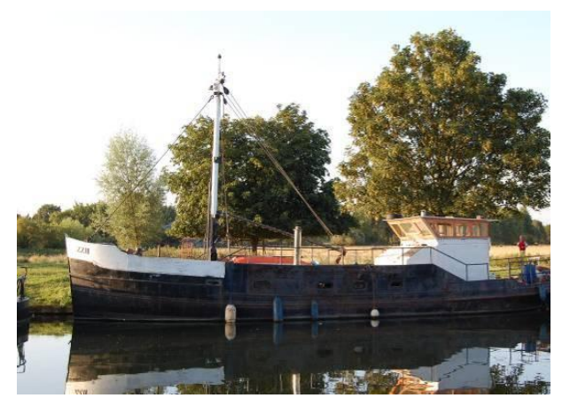
Residential boat on the River Cam