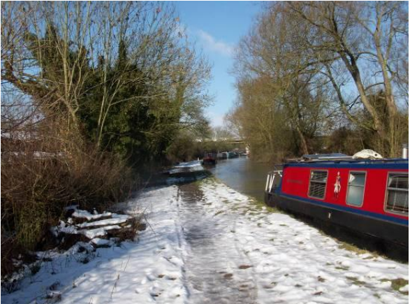
Local Agenda 21 residential moorings, Wolvercote, Oxford Canal, Oxford