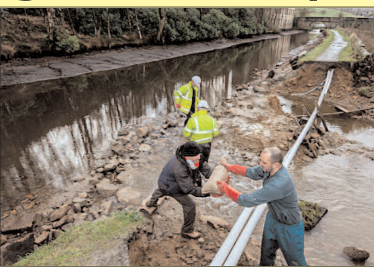
The aftermath of the Boxing Day floods was devastation

Since then the Trust has been talking with the owners of the slope, with a view to reopening the canal as quickly as possible, but progress is slow. C&RT reports: "Whilst discussions continue regarding insurance, one of the landowners has, in the meantime,