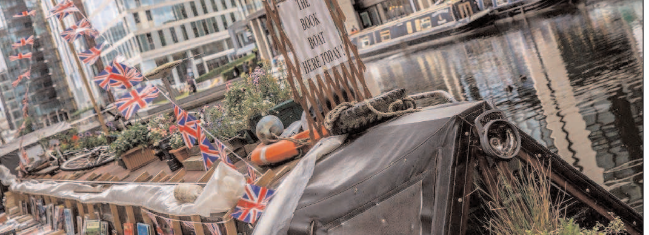
The Book Boat in Paddington Basin - above and below