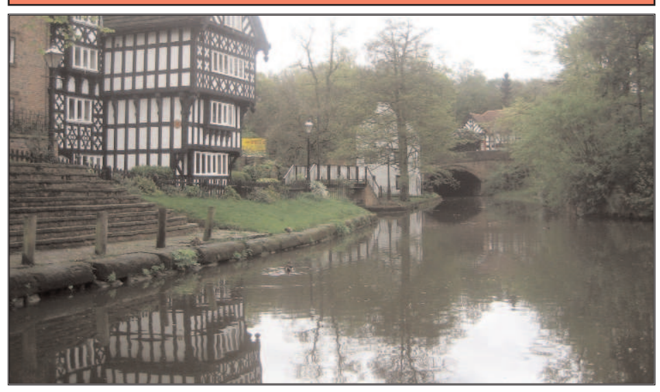
The Bridgewater at Wortsley where the first canal of the Industrial Revolution was built by the Earl of Bridgewater.

Violence between boaters and enforcement officers may have played a role in hard line new rules - claim