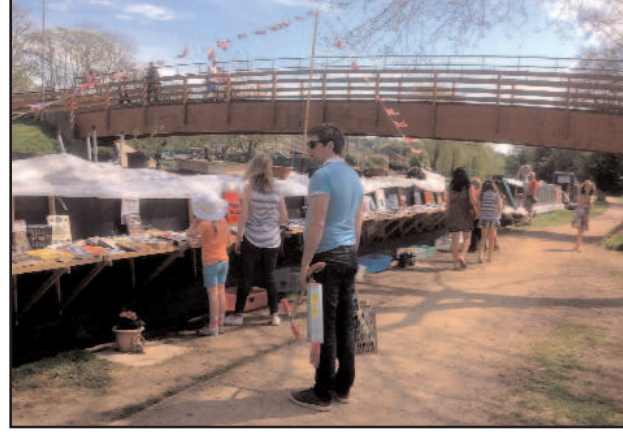
Browsing at Berkhamstead

easy to be rained off. "Having said that, we did the floating market in Paddington basin in June. It's only £20, unlike some of the festivals, and as we are heading to the Thames we felt it would be