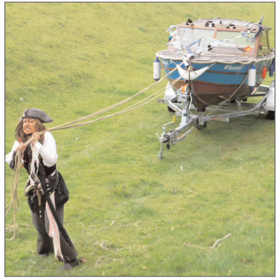
Captain Jack Sparrow hauls Whimbrell along the dry bed of the Lancashire Canal's Northern Reaches

Morecambe photographer. On to Kendal and through Castle Bridge, where the Captains flagging strength was quickly restored by several slugs of brandy, which quickly turned into a mock drunken sword and pistol waving revelry, much to the enjoyment of Sunday after-