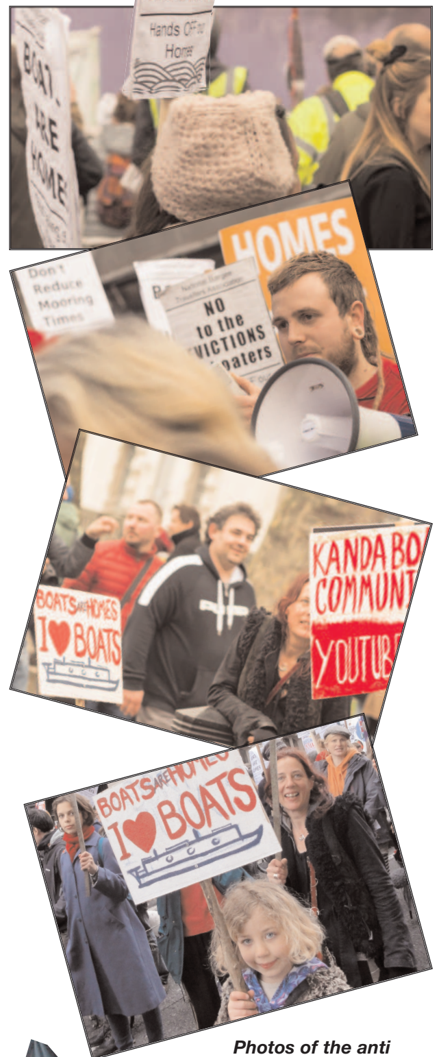
Photos of the anti austerity march