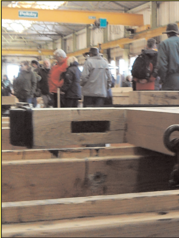
narrow. Alongside the old skills of working green oak and steel fittings there are some innovations with polymer replacing some under water parts previously made from Elm. After returning to Tipton many participants got together for a meal at the recently opened Gongoozler restaurant at the new Dudley Tunnel visitor centre.