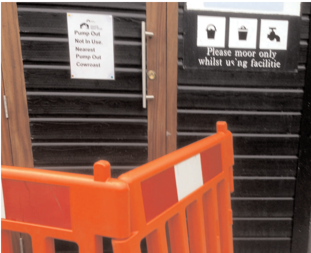
Brand new facilities at Marsworth already broken. boats becoming better spread out and less focused around the handful of current service points.

Cross. C&RT is now restricting the opening hours of the toilets and showers further up the Lee in Stonebridge, despite attempts by the NBTA to negotiate to try to prevent this. With just 13 elsan points, three of them out of use and 20 water taps, with five of them broken, the lot of the 3,500 boats in London compares badly withthose on the rural Shropshire Union Canal with eight water points, eight elsan points, three user operated pump-outs, 14 toilets and four showers serving perhaps a third of the number of boats, with many more non-liveaboards using that canal. London boaters argue that more and better facilities spread more equally across the region would also result in