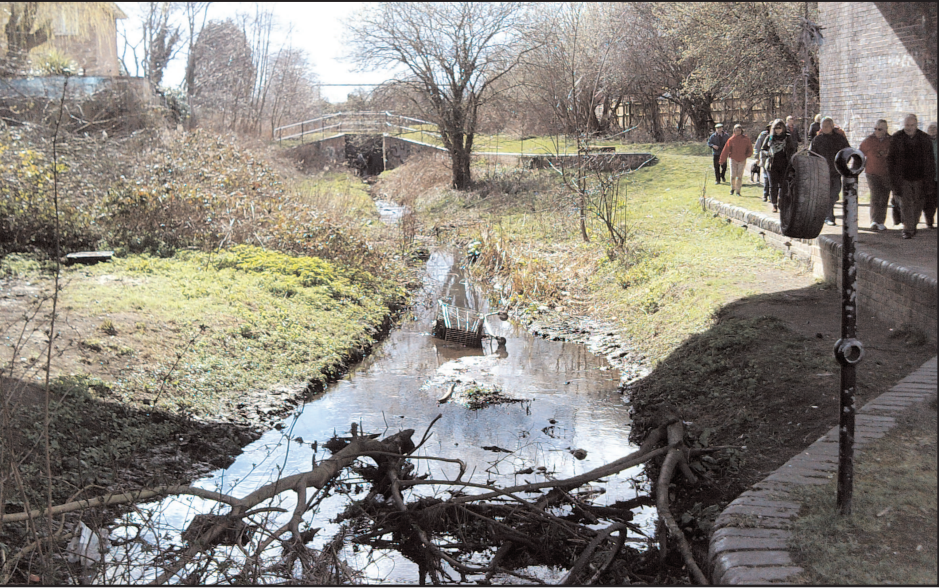
Above: A short pound still in water between infilled locks at the bottom of the Bradley flight. Below: A faded map of 1783 showing how the canal links with others on the BCN.

He is convinced, however that the interest among the public generated by a restoration would benefit the whole area.