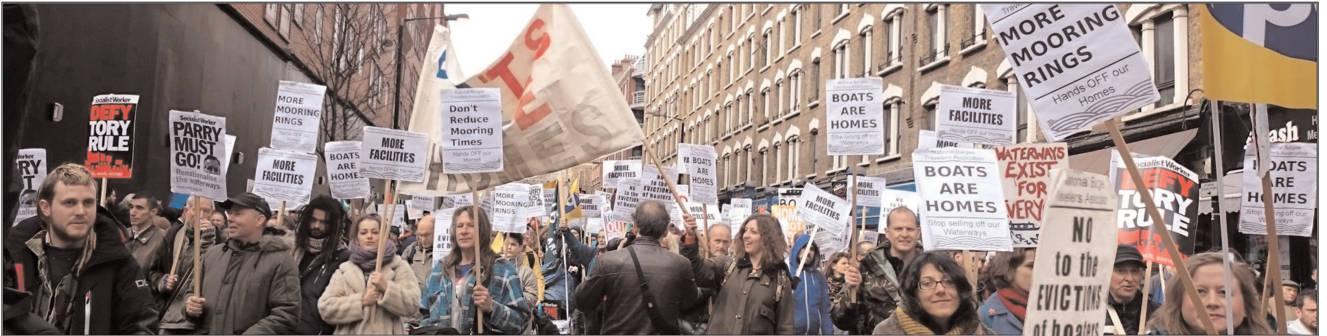
New Mooring Strategy for London to 'manage high number of boats' promised