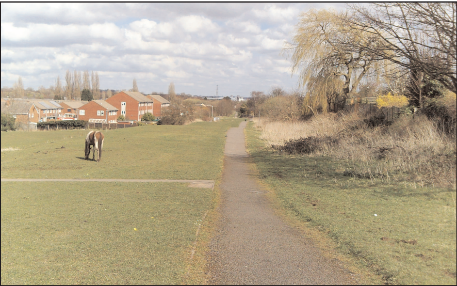
Regular dips in the footpath show where the lock flight once carried boats.

The report was commissioned by the West Midlands Waterways Partnership of the Canal & River Trust (CRT), the Inland Waterways Association, the Birmingham Canal Navigations Society and Birmingham and Black Country Wildlife Trust. Restoring the canal, which includes a flight of nine locks has attracted some local attention after a pub-