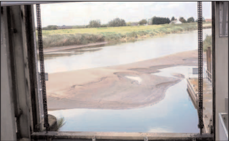
Denver sluice, with the lock on the right, above, and, above right, the silt bank beyond the lock has to be constantly dredged