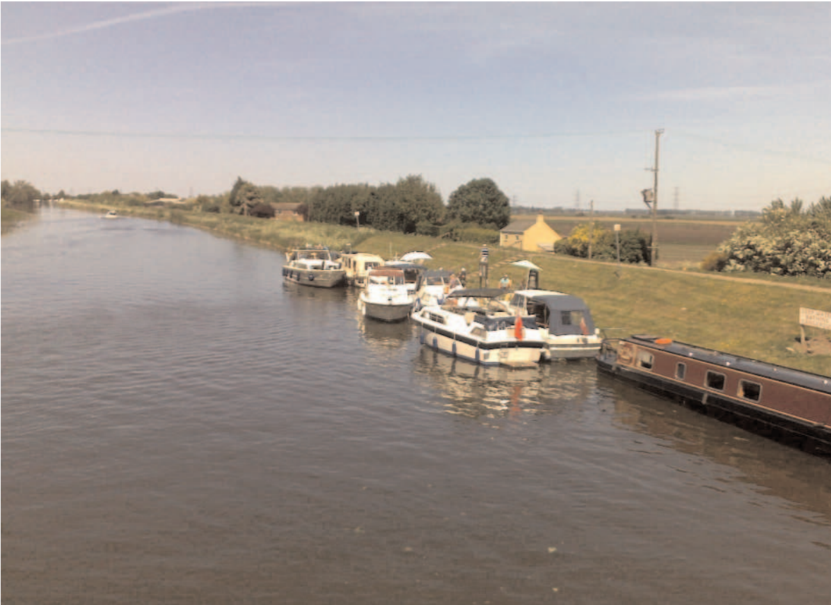
The same Great Ouse mooring in the summer, above, and winter, below

Denver Sluice is one of the main water controls in the area. This is important as, in times of potential flooding of the Cam in Cambridge, the sluice is opened, and due to the very small river fall between Cambridge and Denver, the river is emptied near Denver. Yes, boats are deliberately left high and dry to avoid flooding in